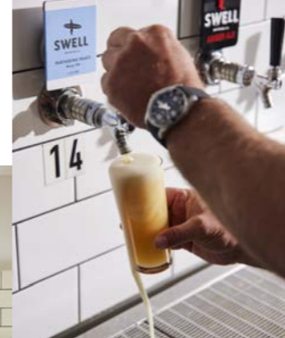
Clockwise from left: the main bar at Swell Brewing Co; the dining room at Maxwell Restaurant; the tasting room at d'Arenberg. Opposite: a distiller at Settlers Spirits; Chalk Hill Collective.