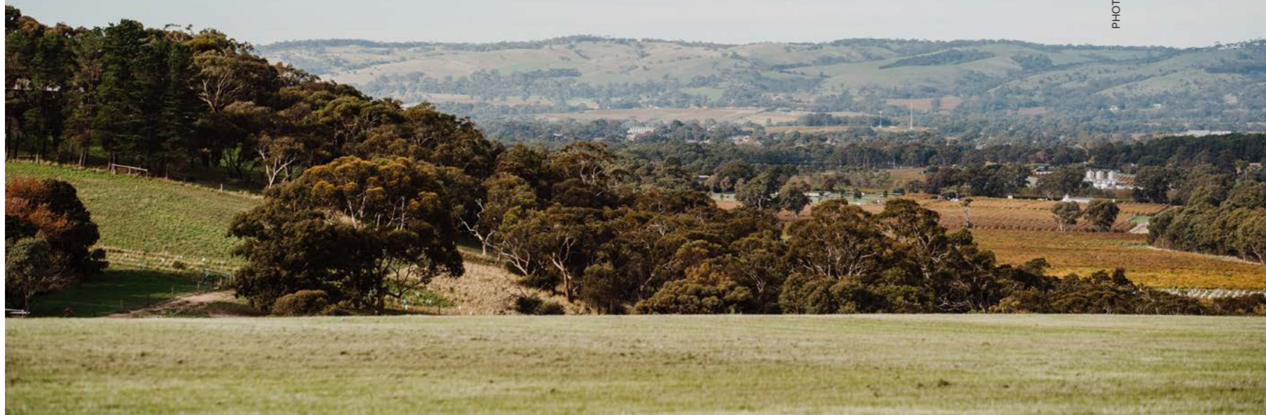
PHOTOGRAPHY MEAGHAN COLES (CHALK HILL COLLECTIVE).

Chalk Hill Collective does an enterprising job of blending wine, spirits and food in one stylish, relaxed locale complete with views.